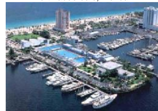
YMCA National Championship Meet International Swimming Pool Fort Lauderdale, Florida

Parents and coaches will thank you for your time. The meet volunteers will even lay out a hospitality suite, “free food and drink”, in a gesture of appreciation. You will not typically hear “Thank-You” from any of the swimmers. They will show you their appreciation in many different ways. It may be as simple as a smile. It may be a quick-witted joke and a grin from behind the start block or the side of the pool. Once you begin to feel comfortable as an official, you will become in-tune with the swimmers. This is when you will feel the athlete’s true appreciation. It is this feeling that stays with you when you leave, that is truly the Officials’ Reward.